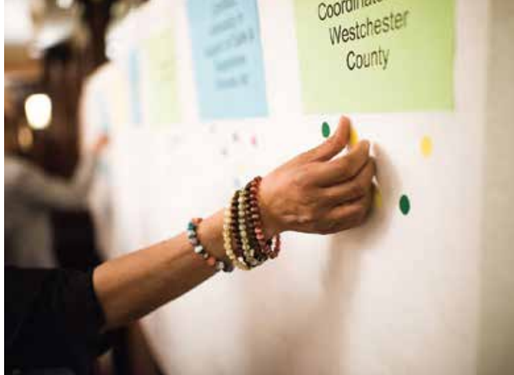
We finished the day by having stakeholders vote on the proposed next action steps, allowing GPS4Kids to have a firm direction to move forward in this year. The following actions were the top four among voting stakeholders:

Roughly 100 GPS4Kids stakeholders filled the room, eager to hear from the working groups and approve the next steps for the GPS4Kids collective. At the conclusion of the working group presentations, participants were divided into small discussion groups to ask clarifying questions and suggest next steps. Participants included students, educators, service providers and more from across the county. Through activities and small group discussions, stakeholders were able to share their vision for the future of GPS4Kids and Westchester County as a whole.