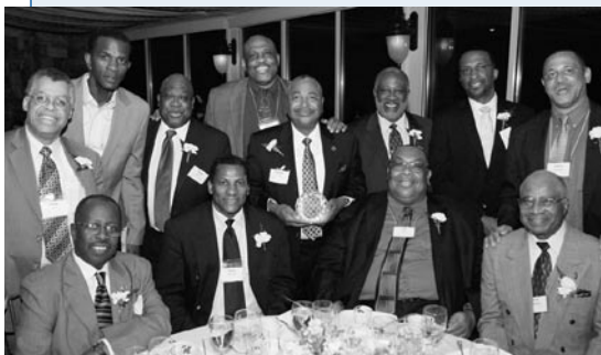
Members of the African American Men of Westchester, Inc.