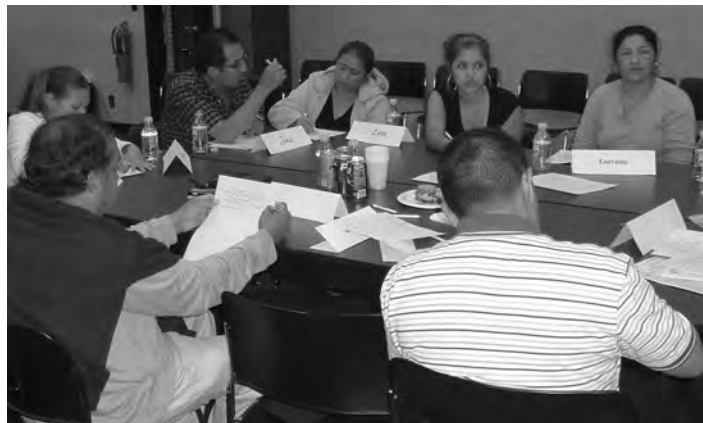
Parents discuss health insurance enrollment barriers in Spanish-speaking focus group.

To address these problems, WCA chaired an interagency Workgroup on Re-Enrollment that developed ideas about the barriers keeping families from easily re-enrolling in insurance programs and what could be done at the local level to overcome these barriers. WCA also conducted two customer focus groups—one in English and one in Spanish—to get direct feedback from families. Based on these insights, we are now working to implement needed changes at the County and State.