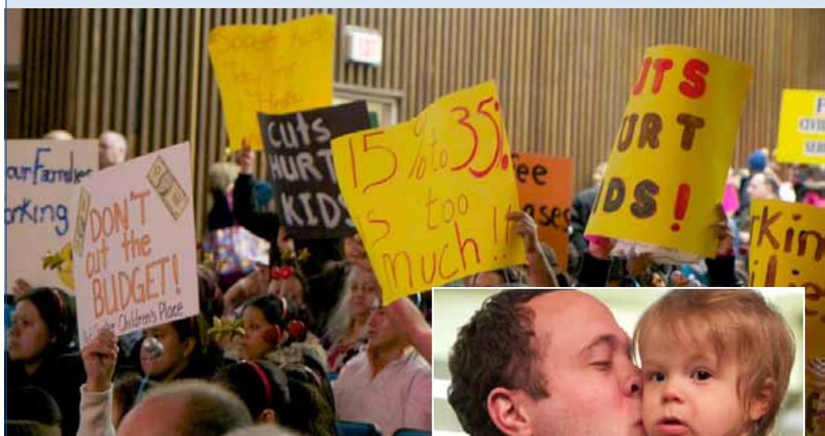
As shown above, hundreds of parents attended the County Budget bearing in New Rochelle to fight for affordable child care for low income families. Some brought their children with them, as did the father, right.

In 2011, Westchester's children faced the twin threats of increased economic and social challenges on the one hand, and shrinking public resources on the other. In response, Westchester Children's Association redoubled our efforts to build a strong, united constituency for children and youth, and to promote practical and effective solutions to their needs.